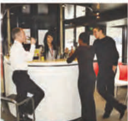
Exclusive: A bar on board