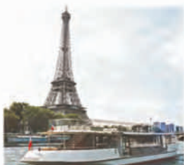
Right by the Eiffel Tower

+ Possibilities of group bookings (20 people min.)