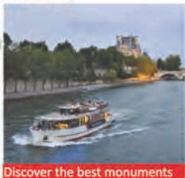
Discover the best monuments